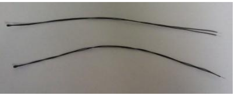
2x thermistors pictured, 200cm length

The Orion Jr. main unit supports 2 thermistors. If more than 2 thermistors are needed, additional thermistors are can be connected to the Orion Jr. unit using the Thermistor Expansion Module (sold separately).