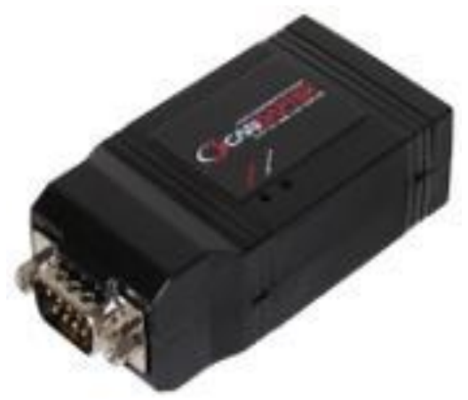
CANBUS to USB adapter (CANdapter)

The CANdapter is a low cost CAN to USB adapter used to monitor CAN traffic for diagnostic purposes. The Orion Jr. unit does not use the CANdapter for programming and no CANdapter is required, but it may be a useful support tool for CAN enabled units. All programming and diagnostics for the Orion Jr. unit are performed using the RS-232 interface on the BMS.